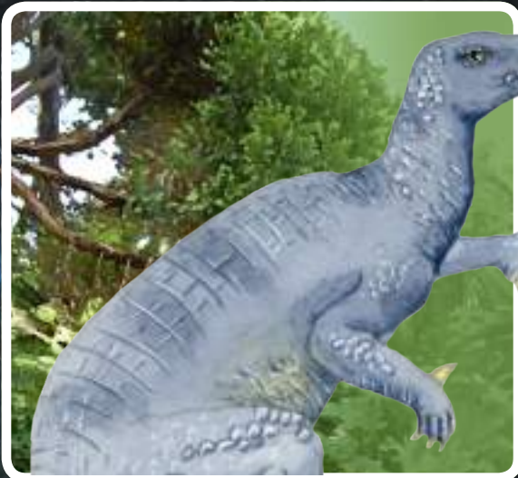
The Lost World